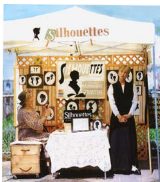
As seen in Vogue