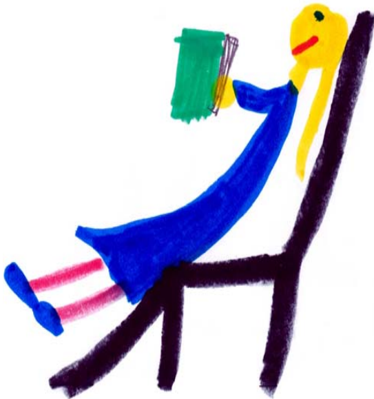
All artwork done by Scouts just like you!